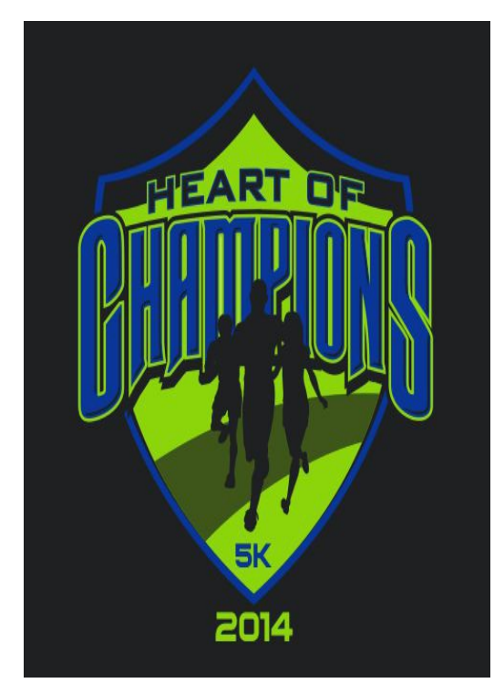
Bay Minette Municipal Pool Complex (1300 Bradley Avenue) Saturday, October 4<sup>th</sup> 5K @ 8am 1 Mile @ 9am

Robertson, Andreoli & Covington City of Bay Minette